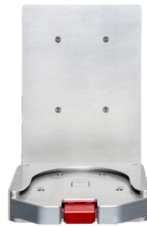
Wall Mount Pro