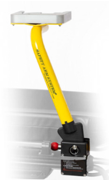
Safety Arm System ®