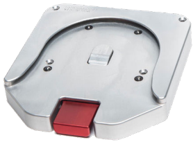
Standard Surface Base