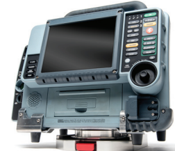
Defibrillator installed on the Bracket Pro Serie™ 35 and Standard Base