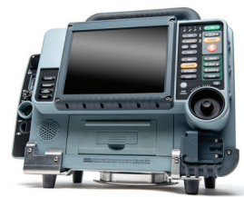
Bracket Pro Serie™ 35 installed under the defibrillator