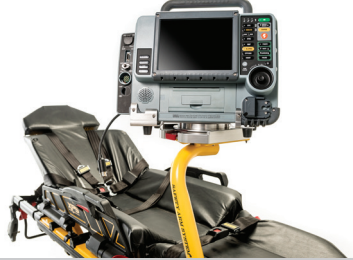
Defibrillator installed on the Bracket Pro Serie™ 35, Standard Base, and Safety Arm System