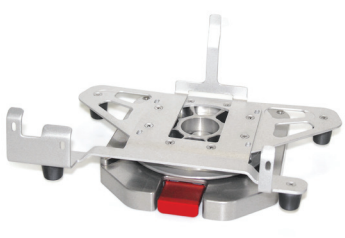
Standard Base & Bracket Pro Serie™ 35 Assembled

Match with other systems from Technimount System