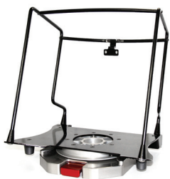
Standard Base & Bracket Pro Serie™ 40 Assembled

Match with other systems from Technimount System