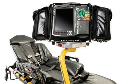
Defibrillator installed on the Bracket Pro Serie™ 40, Standard Base, and Safety Arm System