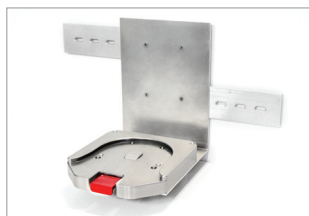
Wall Mount Pro