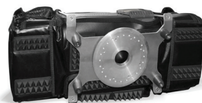
Bracket Pro Serie™ 40 installed on the defibrillator