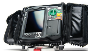
Defibrillator installed on the Bracket Pro Serie™ 40 and Standard Base