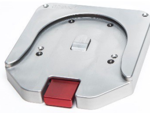
Figure 2 – Support base mounting