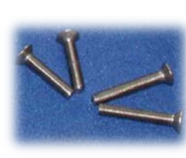
Figure 3 – Screw M4.7mm