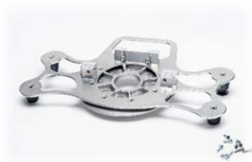
Figure 1 – Bracket mounting