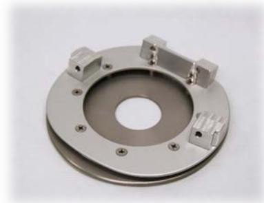
WB (Without Bag) Version