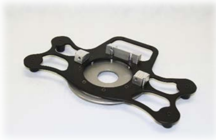
HD (Heavy Duty) Version

You may also have this model of bracket, designed for hospital and / or EMS, instructions for installation are the same, only pictures may be changed.