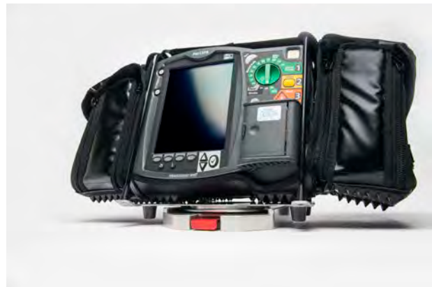
Final installation suggested