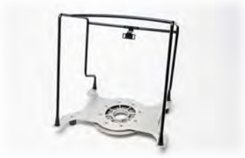
Figure 1 : Support mount – Device section