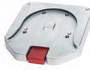
Figure 2 : Support mount – Surface base section

Note: Illustrations may be not the same, depending hospital or EMS model.