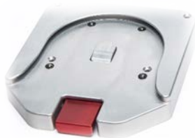
Figure 1 Support base standard version