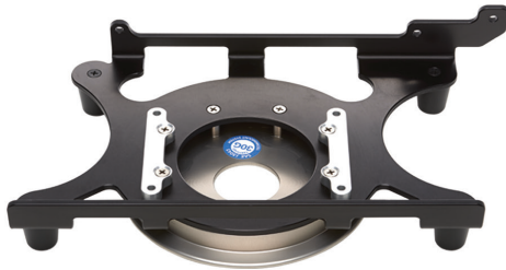
Bracket Pro Serie™ 35 Bracket Device Section Only (top view)