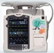
MRx - Hospital