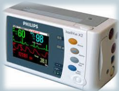
Philips Intellivue MMS X2 Patient Monitor