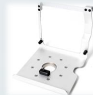
700-10-HM (surface applications ONLY)