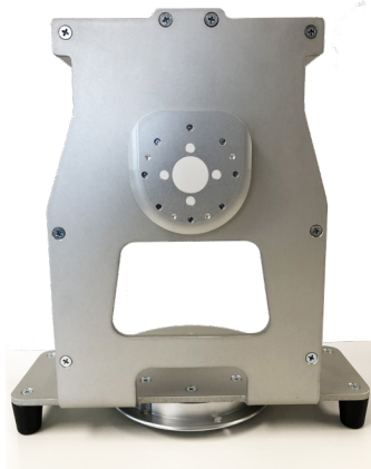
Compatible with Technimount's Products