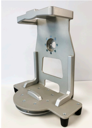
Compatible with Technimount's Safety Arm System