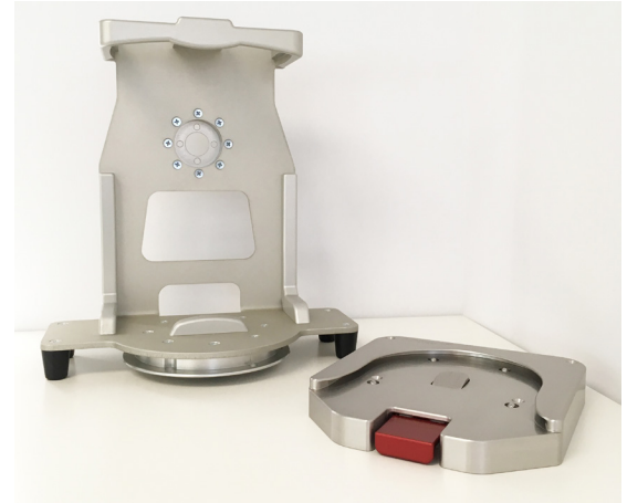
Compatible with Technimount's Universal Standard Base and Extended Bases