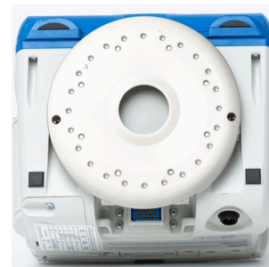
BP 25 Installed on the ZOLL® X Series® without Bag