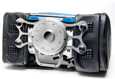
BP 25 installed on the ZOLL® X Series® with Bag