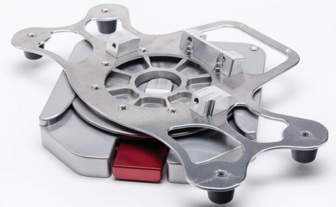
Bracket Pro Serie 25 Complete Assembly (Standard Base & Bracket)