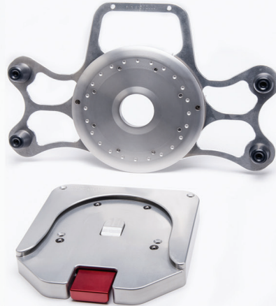
Bracket Pro Serie 25 Complete Assembly (Standard Base & Bracket)