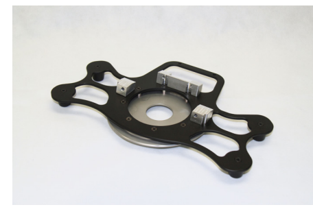
Bracket Pro Serie 25 HD Bracket