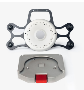
Bracket Pro Serie 25 HD Complete Assembly (Standard Base & Bracket)