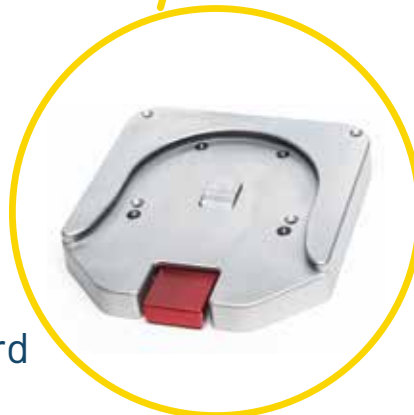
Technimount Universal Standard Surface Base