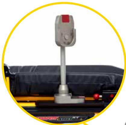
Safety MD Transporter