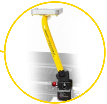
Technimount Stretcher Safety Arm System