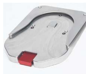
Figure 2 Support base extended version