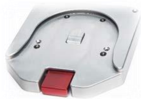
Figure 1 Support base standard version