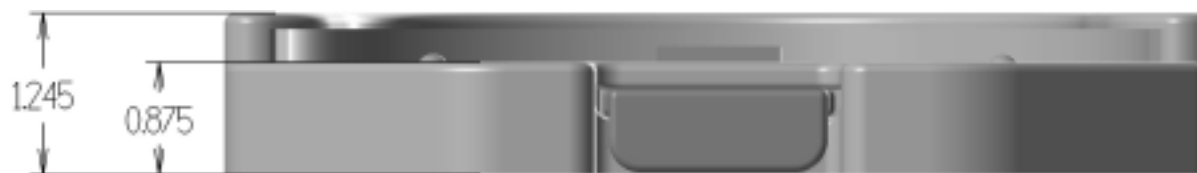
Front view of the Surface base standard

ALL THE DIMENSIONS OF THE DRAWING ARE IN INCH (In.)