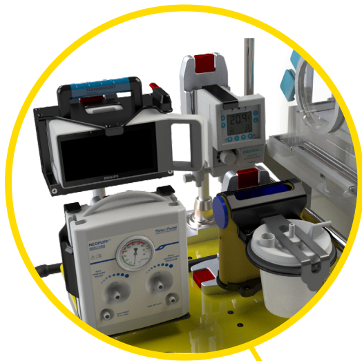
Mounting Systems and Medical Devices on Patient Head Support Structure