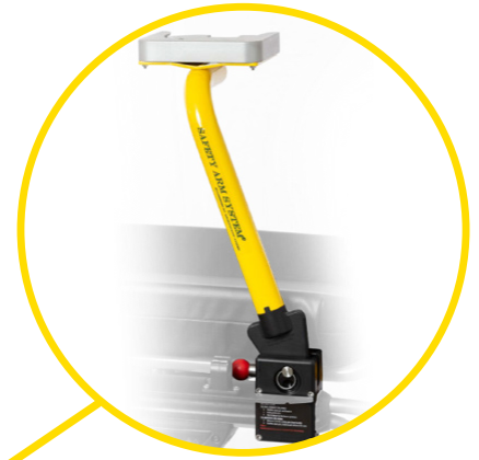
Safety Arm System