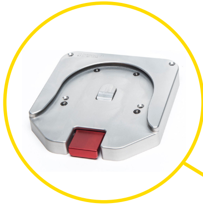
Standard Surface Base