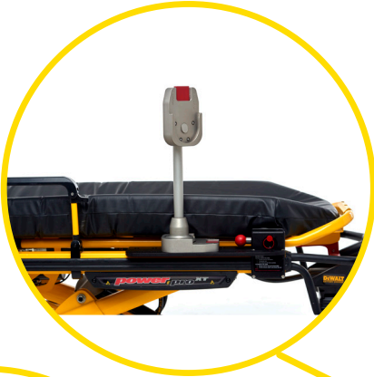
Safety MD Transporter