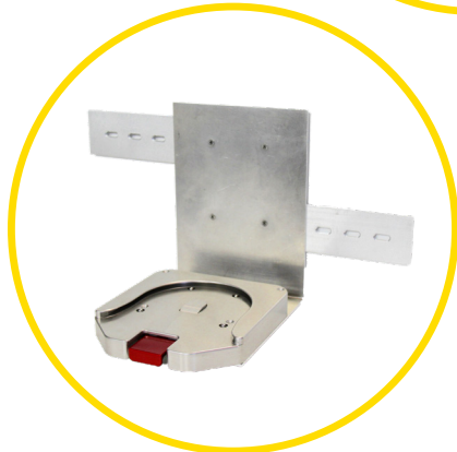
Wall Mount System