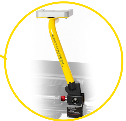
Safety Arm System