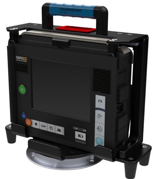
Bracket Pro Serie® 76 - SMT for the Tempus Pro with Smart Mount