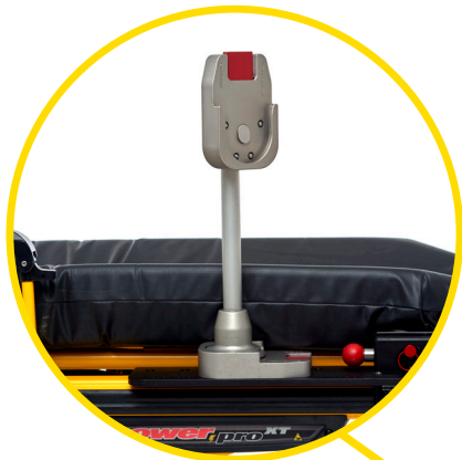
Safety MD Transporter