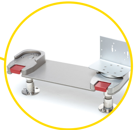
Proplate with 2 Micro Bases for IT Stretchers