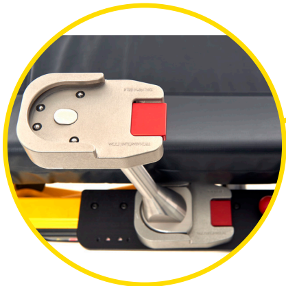
Safety MD Transporter (Horizontal)