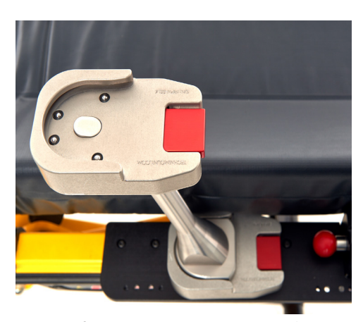
Safety MD-Transporter Horizontal