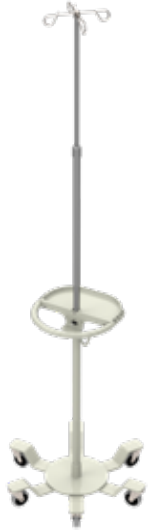
IV Stand -115