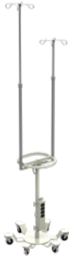
IV Stand -120