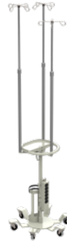
IV Stand -130