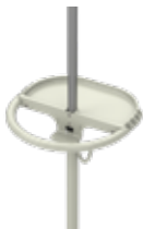
Integrated Tray Handle