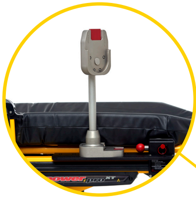
Safety MD- Transporter™