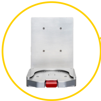
Wall Mount Pro