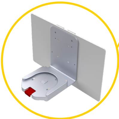
Wall Mount Pro