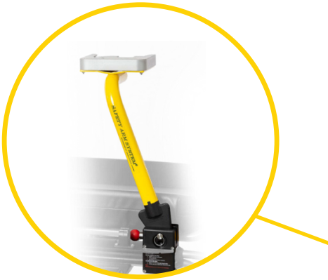
Safety Arm System™