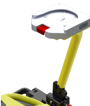
Safety Arm System