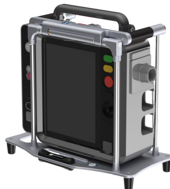
Standard Surface Base